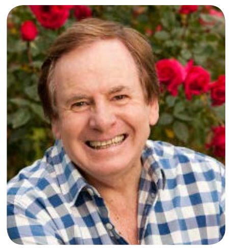
"I personally recommend that all gardeners try this product" Graham Ross, Gardening Presenter

These particular elements play a crucial role in the formation of chlorophyll, which is the substance that makes green plants green. The chlorophyll molecule has the unique capacity to convert the energy of the sun into chemical energy (through photosynthesis).