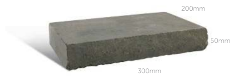
Natural Impressions® Flagstone Cap 3.33 units per l/m

Maximum non reinforced height 700mm + cap (7 courses)