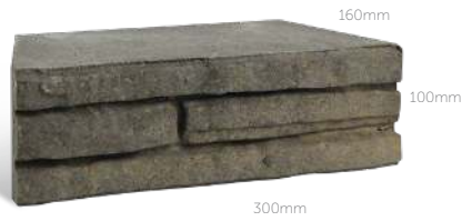
Natural Impressions® Flagstone Block 33.3 units per m 2