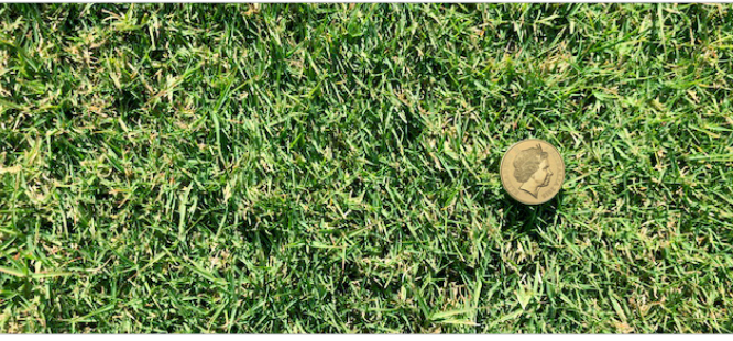
Fig 2. Nullarbor Couch grassed area.