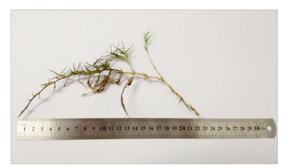
Fig 3. Close-up of live stolon.